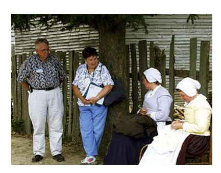
On Friday we visited the Plimouth Plantation, Plymouth Rock, Museum and Mayflower II Tour.

We also visited Pilgrim Hall Museum which was a Gallery Museum with lots of stories of America's founding traditions.